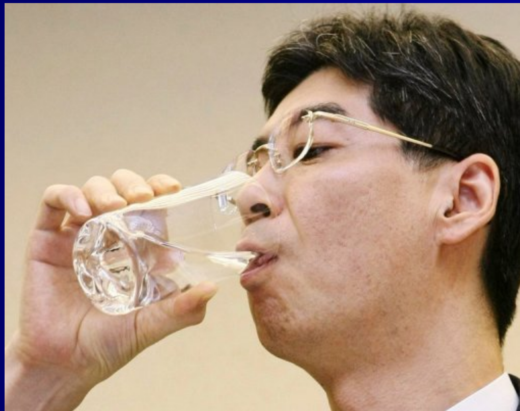
Japanese official drinking water from Fukushima